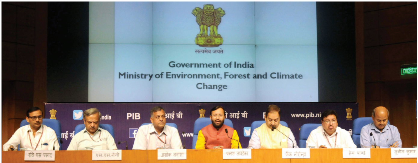
Minister of State for Environment, Forest and Climate Change, Mr Prakash Javadekar, addressing a press conference on INDCs in New Delhi

Second, it launched the International Solar Alliance inviting 120 solar-abundant countries to join the quest for affordable solar power that would eventually replace the fossil fuels of today. The alliance was launched by Prime Minister Mr Narendra Modi, alongside French President Mr Francois Hollande. India is making the initial investment of $30 million and setting up the alliance's headquarters in the country but the plan is to eventually raise $400 million from membership fees and international agencies.